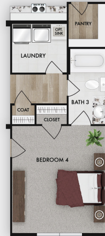
< First Floor Bed 4 + Bath 3 Option