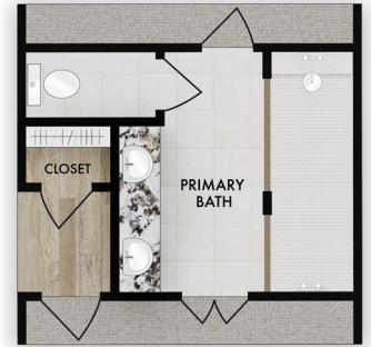
First Floor Primary Bath Walk-In Shower Option