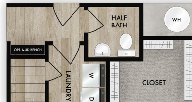
First Floor Mud Bench Under Stairs Option