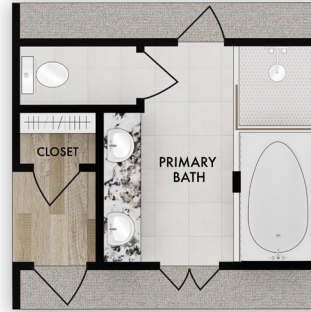
First Floor Primary Bath Tub & Shower Option