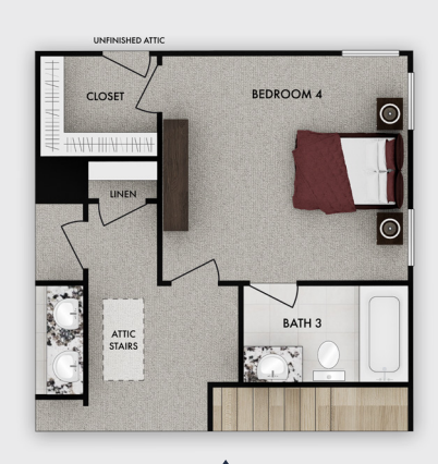
Second Floor Bed 4 + Bath 3 Option