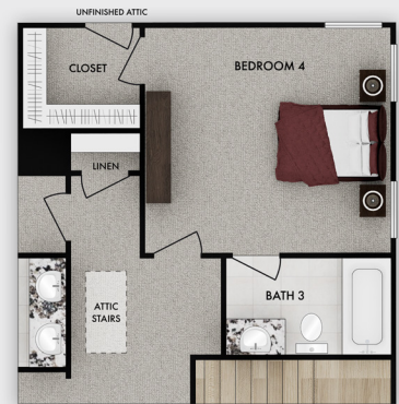
^ Second Floor Bed 4 + Bath 3 Option