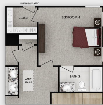
Second Floor Bed 4 + Bath 3 Option