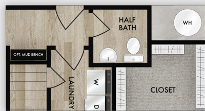
First Floor Mud Bench Under Stairs Option