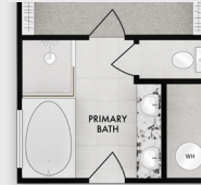
First Floor Primary Bath Tub & Shower Option