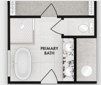
First Floor Primary Bath Free-Standing Tub & Shower Option