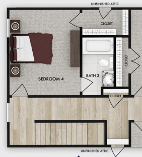
Second Floor Bed 4 Option